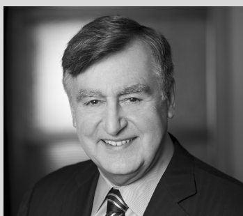
LUCIEN BOUCHARD Senior Partner, Davies Ward Phillips & Vineberg LLP Québec, Canada Age: 75